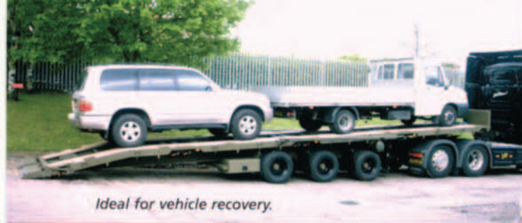
Ideal for vehicle recovery.