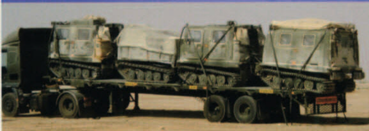
MOD 1983 model, still in service today.

"A wonderfully, flexible trailer acting as a semi low loader, a flat and a container carrier. A great work-horse for over 20 years."